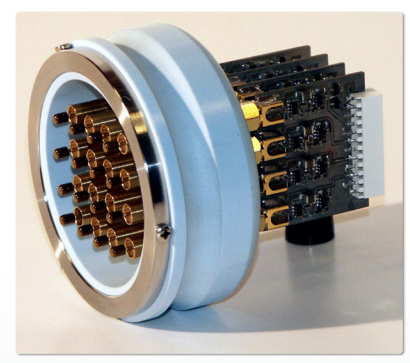
Prototype array of 16 electric potential sensors ~7cm diameter

plessey products are central to applications that require precision and reliability in an increasingly demanding world.